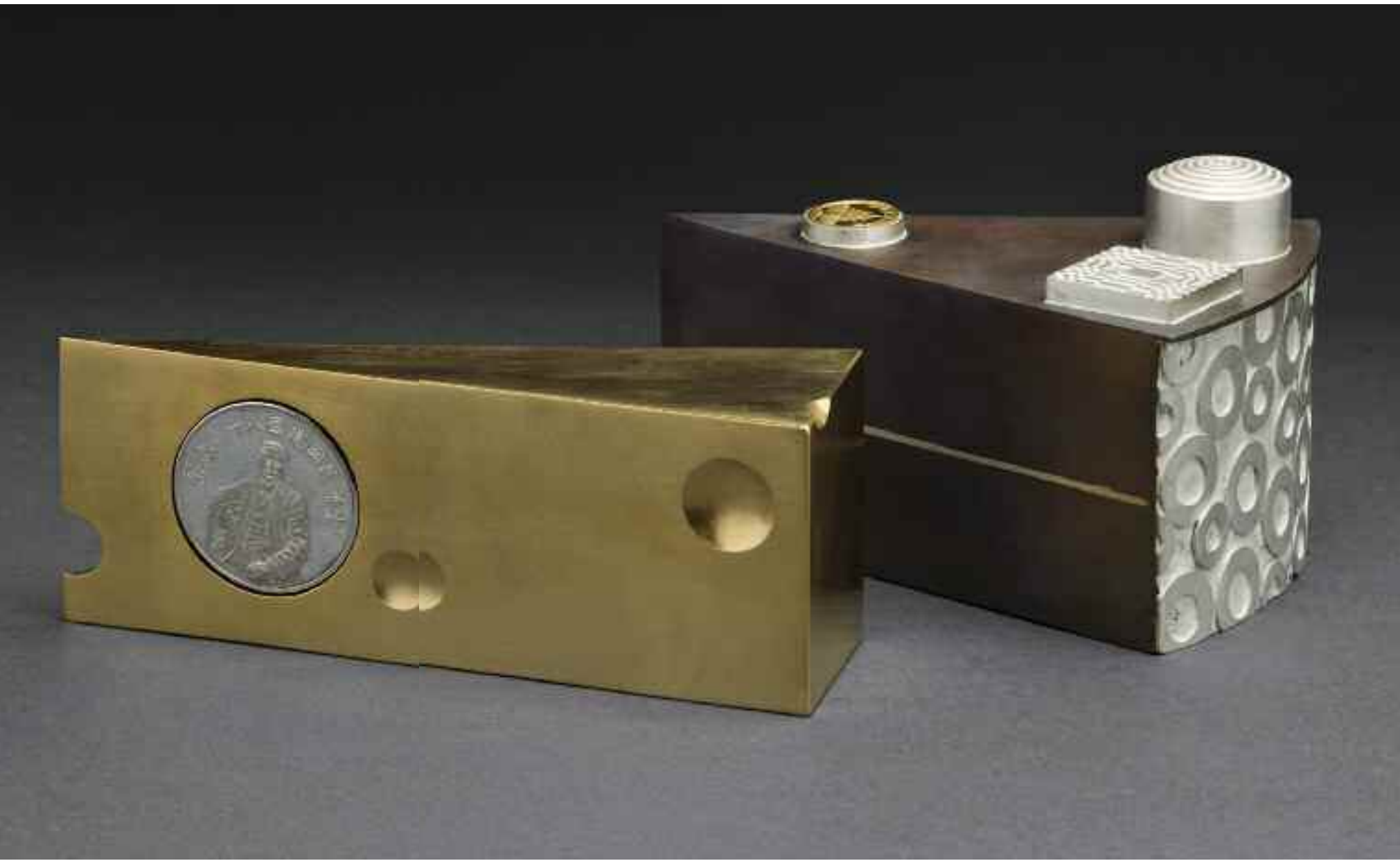
Clockwise from main: Cheese & Cake, goldplated base metal, silver, gold coin (1989, People's Republic of China), silver coin (1991, Taiwan, Republic of China), 2009; Found & Broken, broken glass bottles, found objects; 2011; Bamboo & Cutting Tools, detail, silver, brass, 2010. All by Chien-Wei Chang